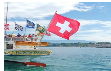
20 th ICL Anniversary celebration