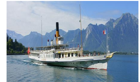
'Belle Epoque' steamer La Suisse

Venue: Ouchy Port - Quai Delamuraz, 1006 Lausanne-Ouchy