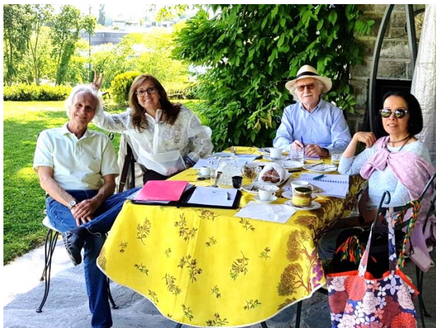
Your committee at work ... with coffee, tea and banana cake

On Tuesday your committee met to prepare the program for the coming months and next year. The first item was to find a new date for the missed Annual General Meeting we had scheduled in May. On the agenda were the reports of the committee, membership and treasury and the future of ICL, all items that are important and must not be missed.